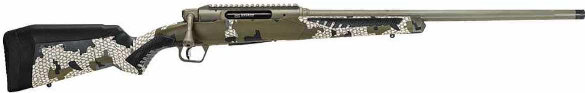
Impulse Straight Pull Big Game

rifle; Winchester turned them out more than a century ago—the obscure but legendary M1895 Lee Navy. But in the modern era, outside of straight-pull ARs, Savage is pretty much the only game in town. And has a leg up on its competitors from across the pond. Whereas a Blaser or Anschutz take a second mortgage to shoehorn into a safe, the Impulse leaves a little money in the shooter's pocket. Though, with its most affordable models coming in at $1,379, they still aren't exactly bargain-rack ventures.