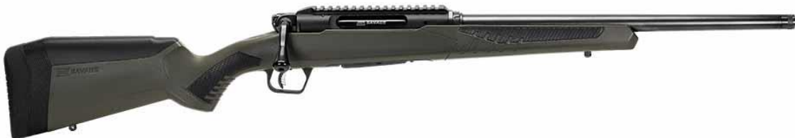
Impulse Straight Pull Hog Hunter

The Impulse Straight Pull is Savage's first foray into the design and their engineers pull out all the stops, with the rifle boasting 13 patents. Of particular note is the locking apparatus. Dubbed the "Hexlock", the rifle utilizes six hardened bearings to lock the bolt in place inside the receiver's barrel extension. It's a bit of a whack-a-mole system, where the bearings pop out and retract into the bolt head. One advantage of the system, it does away with the complex cams rotating bolt straight pulls rely on. Furthermore, Savage states it creates a more secure lockup. As the company describes it, "As pressure increases, Hexlock's hold tightens, ensuring that there can be no rearward movement of the bolt. Once the round has left the barrel, the pressure subsides, and the action can safely open again with the straight pull of the bolt handle."